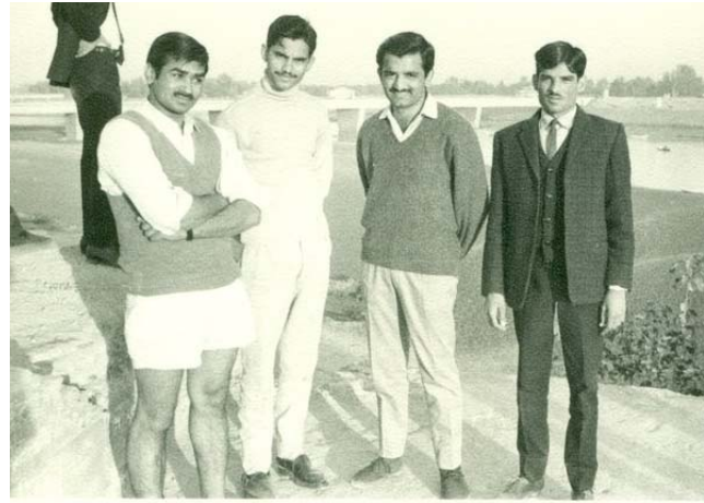
At river Ravi-Lahore (1968-690)